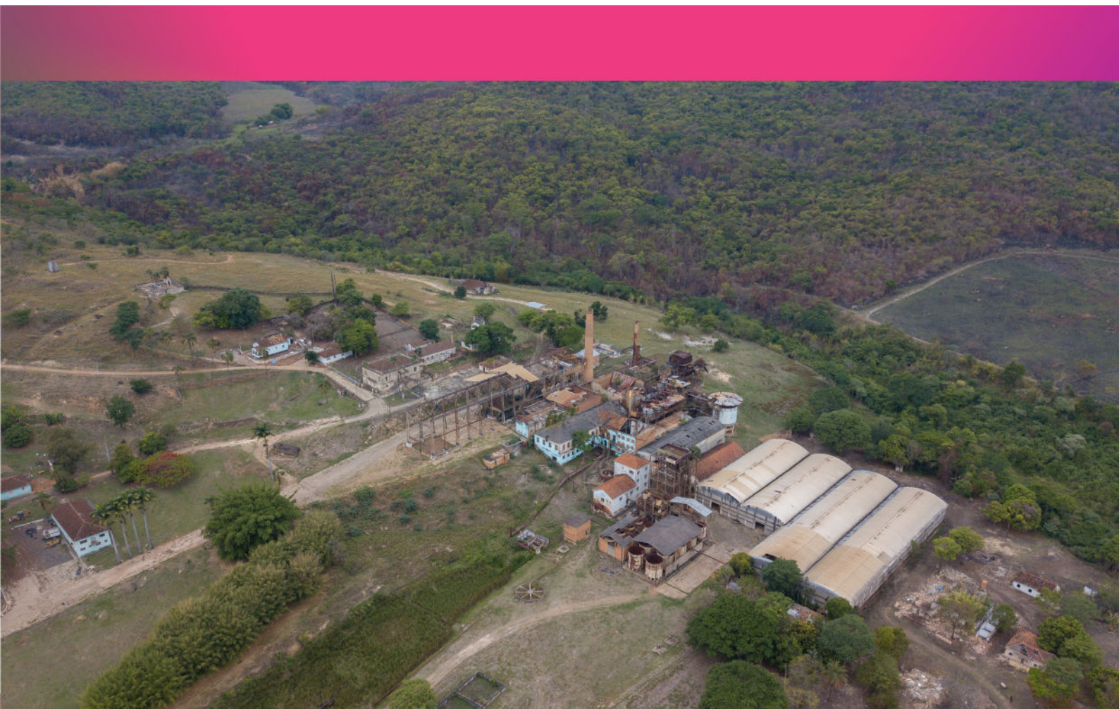
Aerial photo of ruins of the plant that originated the MST occupation in Campo do Meio (MG)