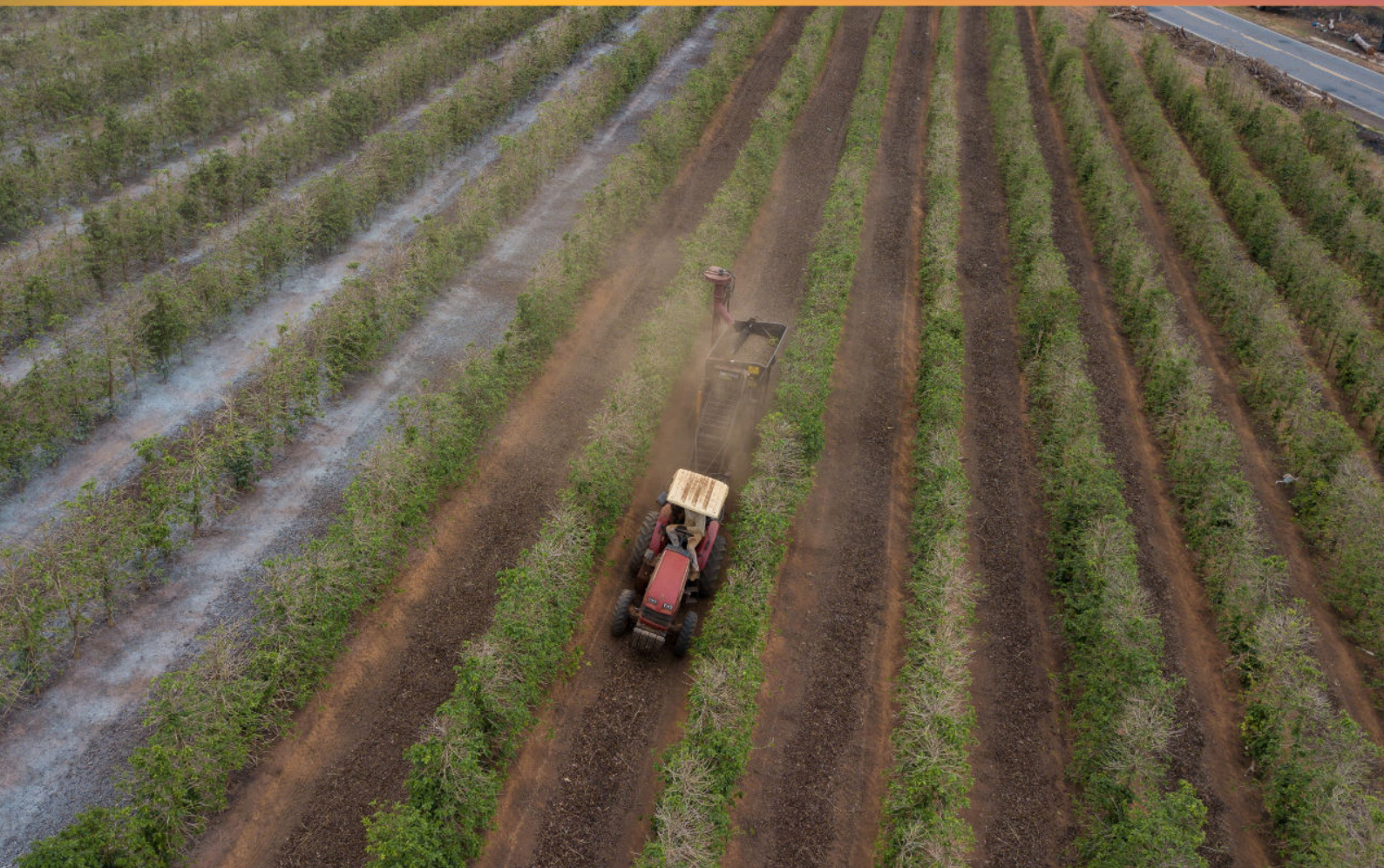
Fertilizer application by tractor