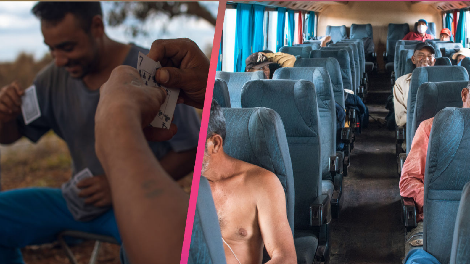
Photo of workers at rest without a mask

pany (Emater-MG) published a booklet with guidelines for preventing the new coronavirus during harvest season. 37