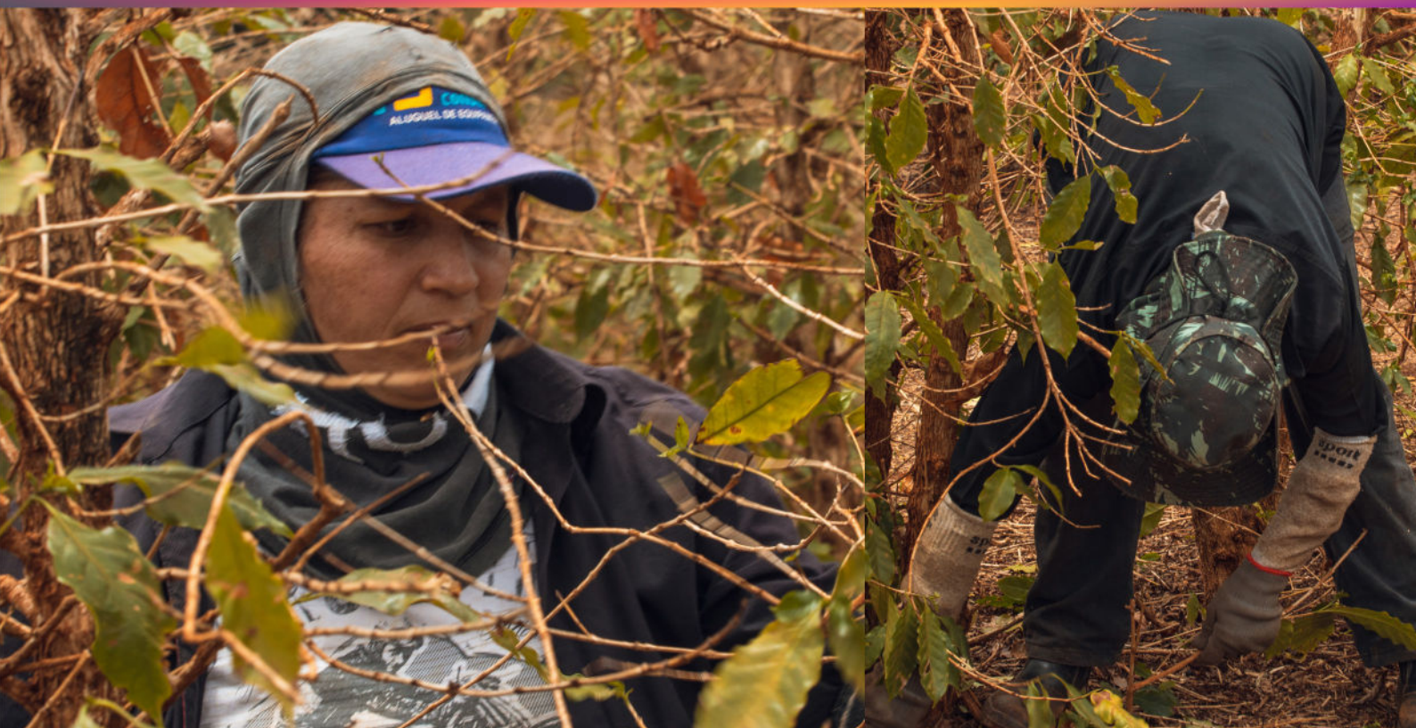
Rural workers in a coffee farm

“During harvest season, you have, say, 2,000 workers in a given municipality. In the off-season, that number falls to 600 workers. Both producers and workers know that there is a reserve labour pool. Workers know that the season is over, jobs are over, so they won’t run any risks and then they end up accepting