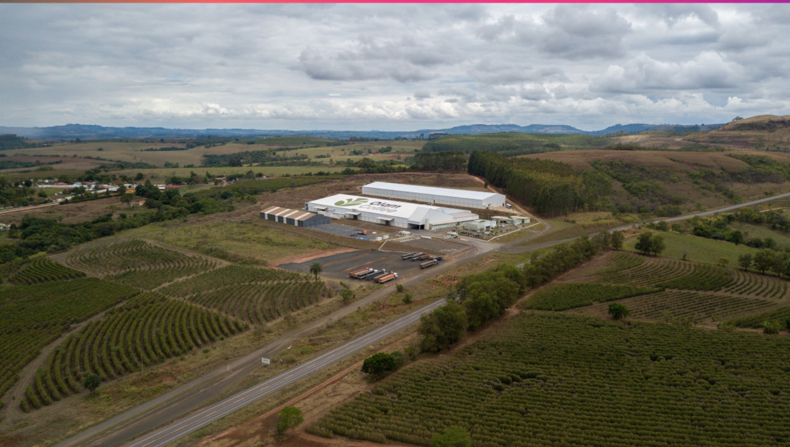
OLAM facilities at São Sebastião do Paraíso, MG