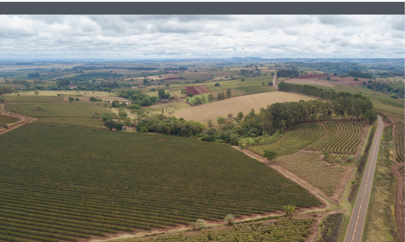
Aerial view of a coffee farm in São Sebastião do Paraíso (MG)

“When we have hearings, employers often argue that the industry is undergoing a crisis, but what happens when the industry makes big profits? Weren't they supposed to provide more benefits?”